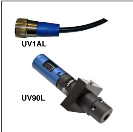
Fig 1. UV Scanners